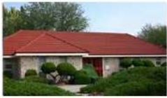
Asphalt Roofing Shingles