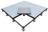
Raised Access Flooring