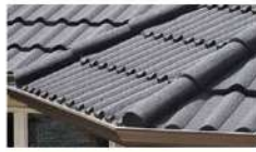
Metal Roofing Tile