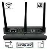
Switching & Control Solution