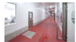
FRP Wall Protection Panels