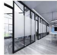
Glass Wall Partition