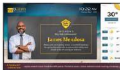
Digital Signage Solution