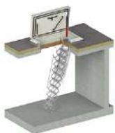
Roof Hatch & Ladder