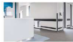
PVC Wall Protection System