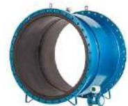
Electromagnetic Flow Meter