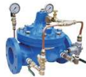
Pressure Reducing Valves