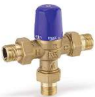
Thermostatic Mixing Valves