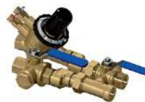
Hook Up Kits