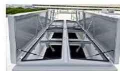
Fire Rated Smoke Vent