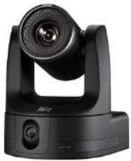
Video Conferencing Solution