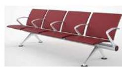
Public Area Seating