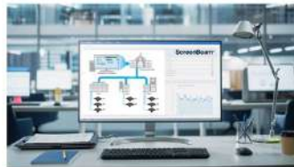
Wireless Presentation System