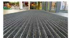
Entrance Matting System